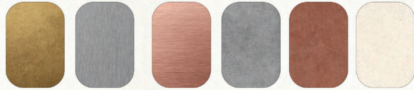
Bronze Grey Metal Rose Gold Grey Terracota Beige

At The Ridge, every detail is thoughtfully considered to create a more personalized living experience. Homeowners have the opportunity to choose from carefully curated villa colour palettes, allowing each home to reflect individual taste while maintaining a harmonious community aesthetic.